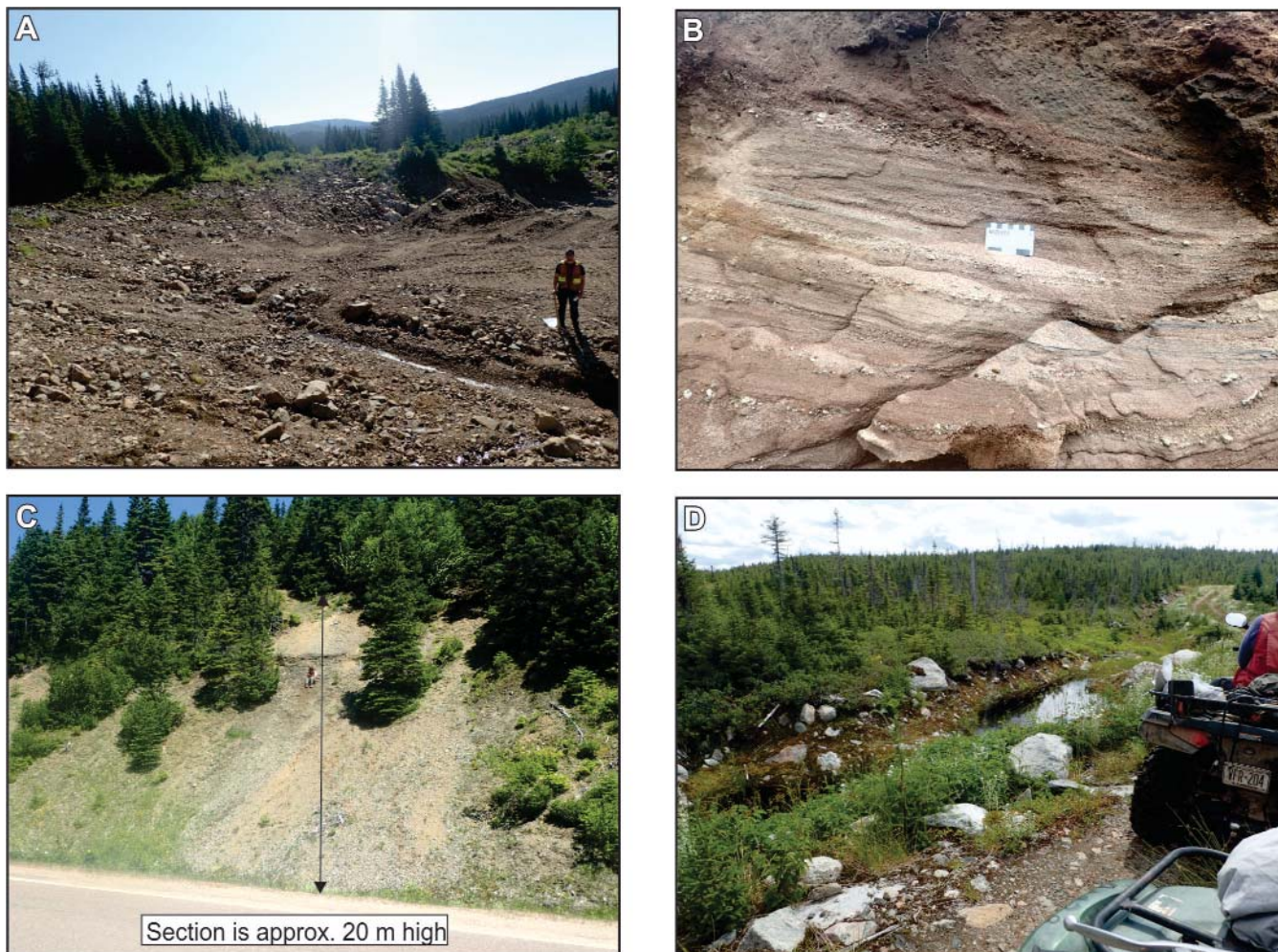
Plate 3. A) Sand and gravel forming hummocky topography, mapped in the northwest corner of the Cormack map area; B) Crudely stratified sand and granule- to pebble-sized gravel mapped in the southwest corner of the Cormack map area; C) 20-m-high section comprising sand and grading downward to cobble-sized gravel mapped in the northeast corner of the Silver Mountain map area, D) Organic-till complex mapped at low elevations in the north-central Silver Mountain map area.

Silver Mountain (NTS 12H/11) map areas. This region was previously mapped almost 30 years ago and is prospective for Au, bitumen/shale oil, Cu, Ni and U. Therefore, the three main objectives of this study are to: 1) update the surficial geology of the two map areas, 2) reconstruct the glacial history of the region; and 3) carry out a regional till-sampling program to characterize the regional till geochemistry.