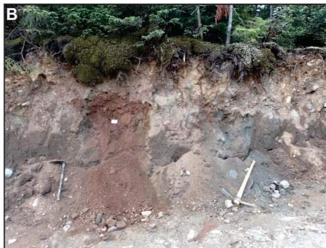
Plate 1. A) Ice-flow measurement from striations and grooves on flat bedrock surface, taken in the north-central Silver Mountain map area. Bi-directional arrows indicate the ice-flow movement; B) Till sample site 17SH111-1099 in the central portion of the study area is scraped to expose C-horizon till.