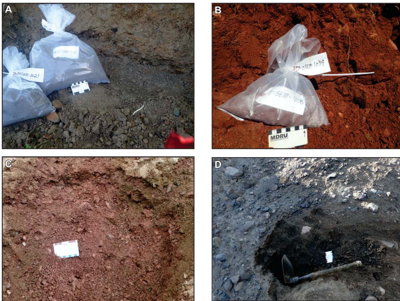
Plate 2. Four distinct till types identified in the study area. A) Till sample 17SH111-1021 taken over Rocky Brook Formation rocks, in west-central Cormack map area; B) Till sample 17SH111-1038 taken over North Brook Formation rocks, in west-central Cormack map area; C) Till sample 17SH111-1066 taken over Taylor Brook gabbro, in central part of the study area; D) Till sample 17SH111-1131 taken over Long Range Inlier rocks, in west-central Silver Mountain map area.